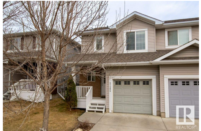
21304 45A Ave NW, Edmonton, AB

Main Floor Exterior Area 542.37 sq ft Interior Area 480.49 sq ft Excluded Area 209.11 sq ft