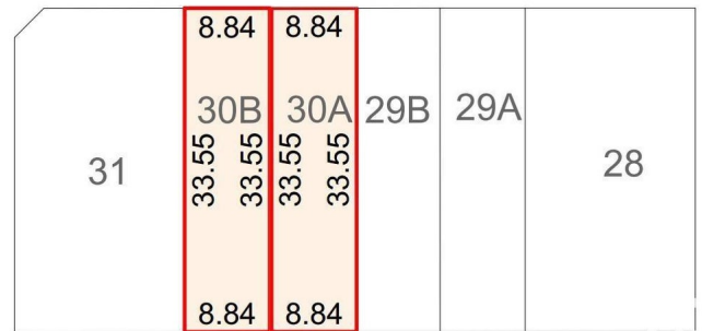
LOT DIMENSION DETAILS